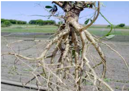
Shockwave BR has a branch rooted trait that allows it to perform better in higher water tables.