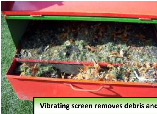
Vibrating screen removes debris and returns crumb rubber to playing surface.