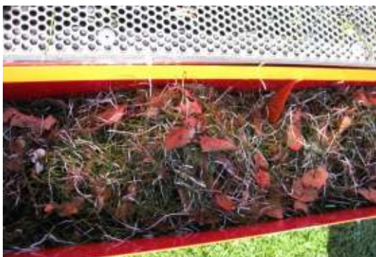
Debris collects in hopper for easy removal.

NOVEMBER 23, 2010 WASHINGTON LOCAL SCHOOLS WHITMER MEMORIAL STADIUM TOLEDO, OH