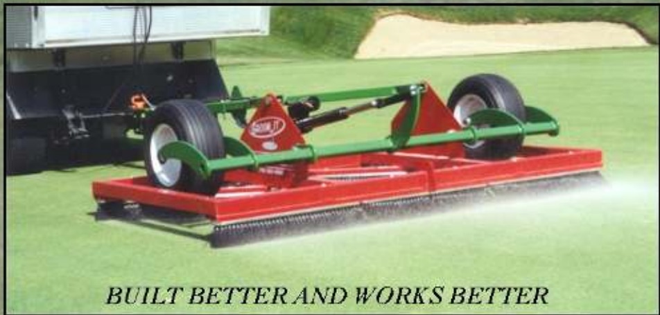
BUILT BETTER AND WORKS BETTER