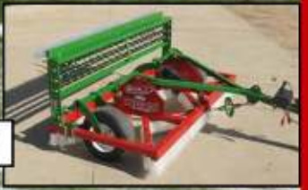
Rake Flips Up!