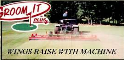
WINGS RAISE WITH MACHINE