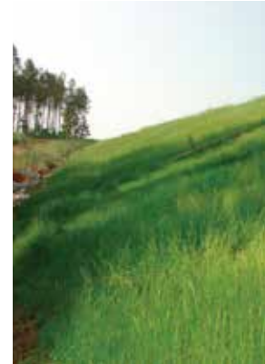
Effective immediately and grass grows twice as fast as blankets