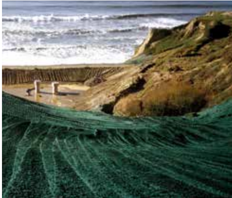
Less expensive than extended term blankets, and less soil preparation is required