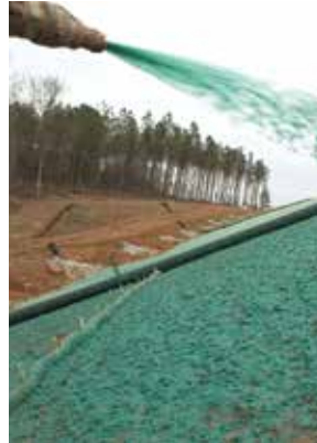
Same speed and cost-savings of other hydraulic applications, but lasts twice as long