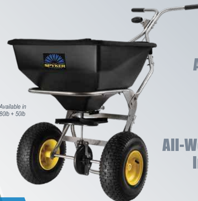
Available in 80lb + 50lb

Industry's First Ergonomically Approved Handle