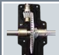
Fully Enclosed Metal Gears with Zerk Fittings