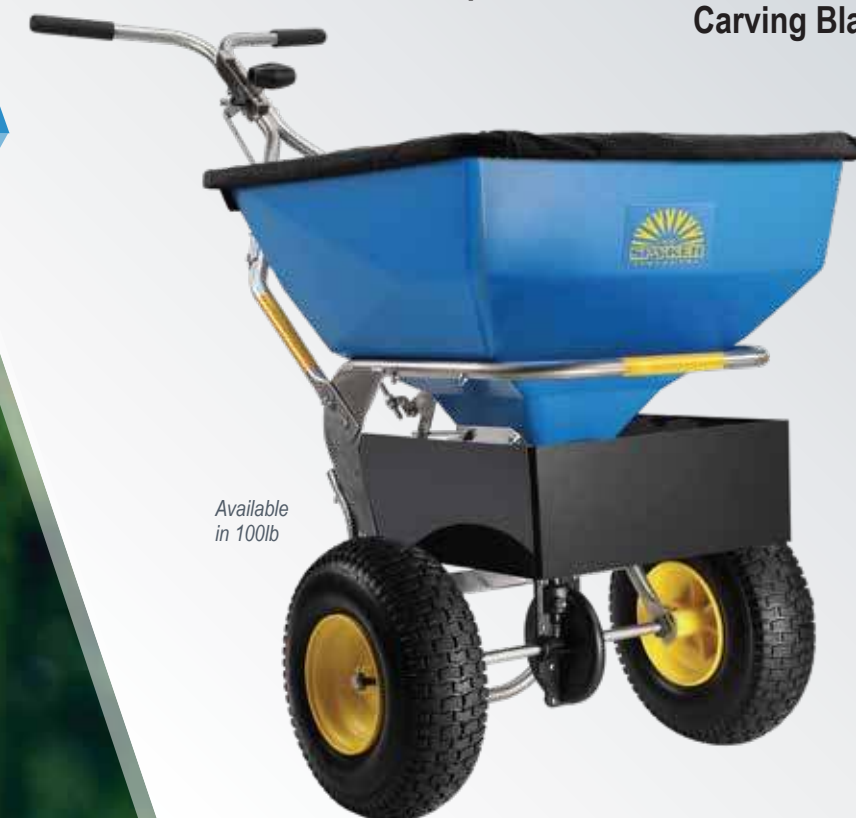
Available in 100lb